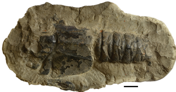
Figure 3. Coleia brodiei (Woodward, 1866), Bath Royal Literary and Scientific Institution, catalogue number M3537 (Charles Moore coll.). Lower Lias (?early Pliensbachian, Davoei Zone), Mickleton Tunnel, Gloucestershire, United Kingdom. Scale bar equals 10 mm.

2010 Coleia brodiei [sic] (Woodward). Collins, p. 296, pl. 53, fig. 4.