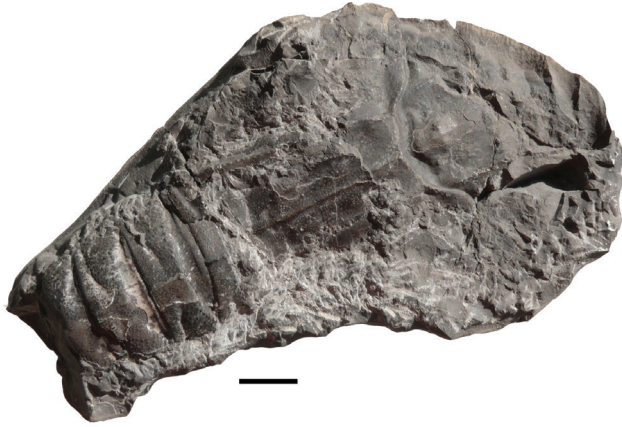
Figure 2. Coleia brodiei (Woodward, 1866), SMNS 70042, early Pliensbachian, Davoei Zone, former temporary clay-pit “Am Danebrock – Crashkurs-Bahn” in Westercappeln-Velpe near Osnabrück, Lower Saxony, Germany. Scale bar equals 10 mm.